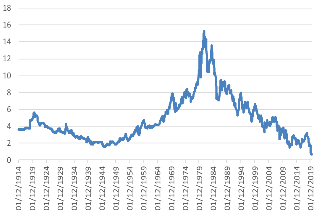
Figure 2. 10-Yr US Bond yield (average of monthly observations).

AutoRegressive Moving Average (ARMA) model, we follow the non-parametric approach of Bloomfield (1973) that has been shown to work well in the context of fractional integration (see Gil-Alana 2004c).