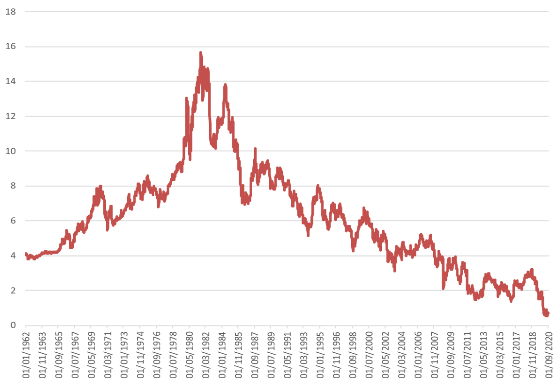
Figure 1. 10-year US Bond yield (.USGG10Y index).

where m indicates the degree of non-linearity. Thus, the higher m is, the less linear the approximated deterministic component is (see Hamming 1973; Smyth 1998). Bierens (1997) and Tomasevic, Tomasevic, and Stanivuk (2009) argue that it is possible to approximate highly non-linear trends with rather low degree polynomials. In this context, if m = 0 the specification contains only an intercept; if m = 1 a linear time trend is also included, and if m > 1 , non-linearities are allowed. When estimating the model given by (1) we set m = 3 , thus capturing non-linearities in the series if \theta_2 and/or \theta_3 are statistically significant. We also assume that the errors are autocorrelated to allow for some degree of weak dependence. However, instead of using a standard