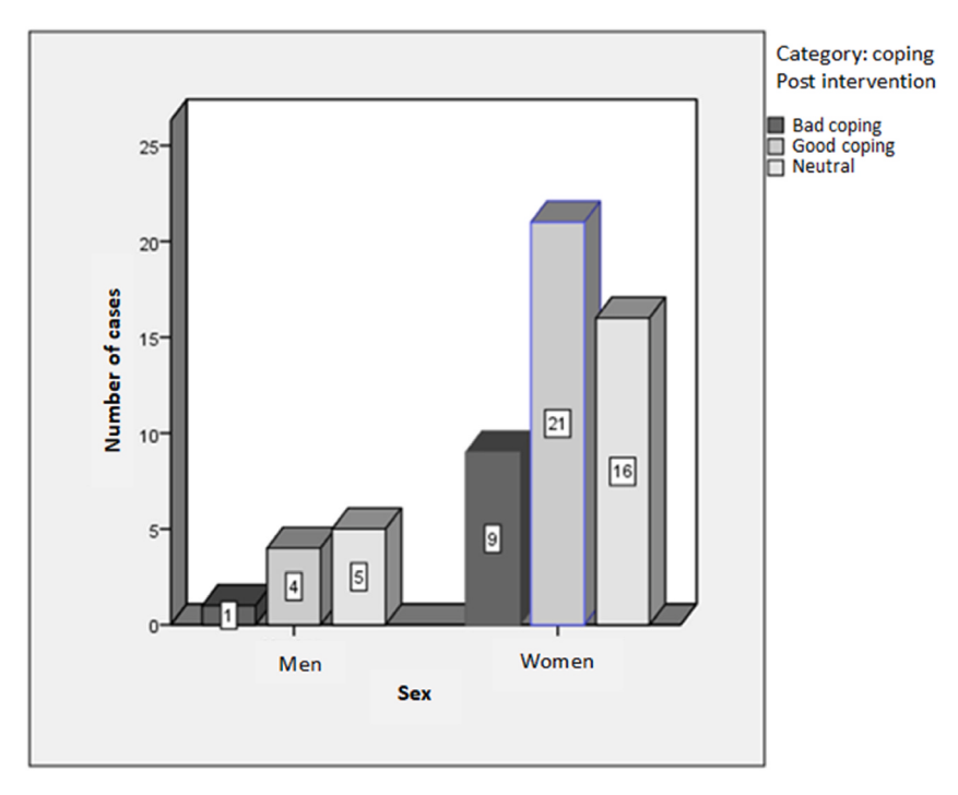
Fig. 2. Distribution of coping with death by sex.