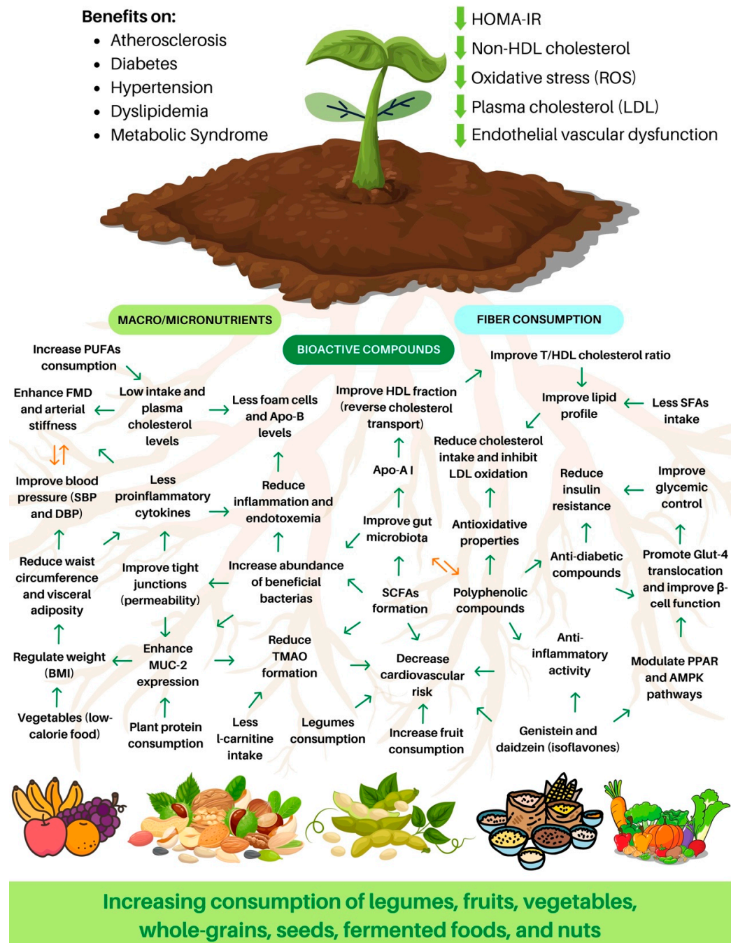
Figure 2. Benefits of consuming a plant-based diet. TMAO: trimethylamine N-oxide; FMD: flow-mediated dilatation; SFAs: saturated fatty acids; PUFAs: polyunsaturated fatty acids; HDL: high-density lipoprotein; LDL: low-density lipoprotein; T/HDL cholesterol: total cholesterol and HDL cholesterol ratio; Apo: apolipoprotein; SBP: systolic blood pressure; DBP: diastolic blood pressure; BMI: body mass index; Glut-4: glucose transporter; SCFAs: short-chain fatty acids; PPAR: peroxisome proliferator-activated receptors; AMPK: AMP-activated protein kinase; ROS: reactive oxygen species; HOMA-IR: Homeostasis model assessment of insulin resistance; MUC-2: mucin-2.