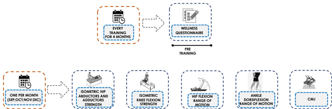
Fig. 1 Experimental design

at the same time of the day (i.e., to avoid the influence of circadian rhythms) on neuromuscular performance that has been reported in other female team sports [14].