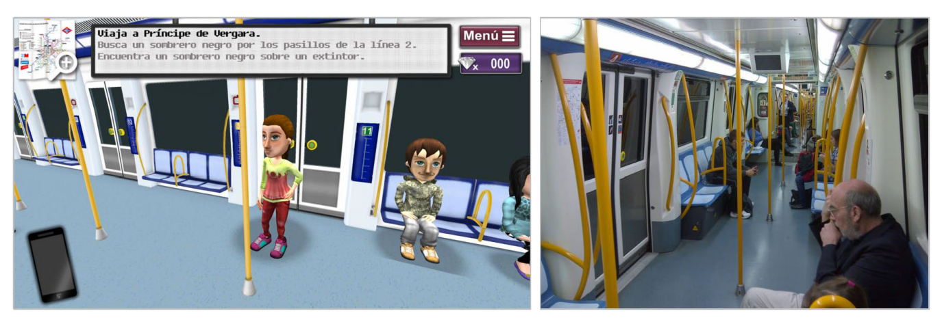
FIGURE 1. The game is designed realistically to promote the learning transfer to reality. Snapshot of the interior of a wagon in Downtown (left) and the real wagon in the subway of madrid (right).