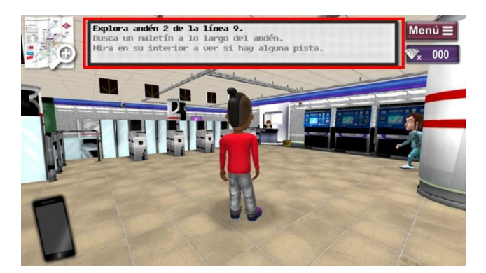
FIGURE 3. The game asks for tasks sequentially and remain in the screen to help the user remind what the ongoing duty is.

For designing Downtown , we interviewed four experts (psychologists and trainers) from Down Madrid to identify the main barriers affecting the capacity of the users about learning concepts with a videogame and other general issues that may affect to their ability for traveling in the subway independently.