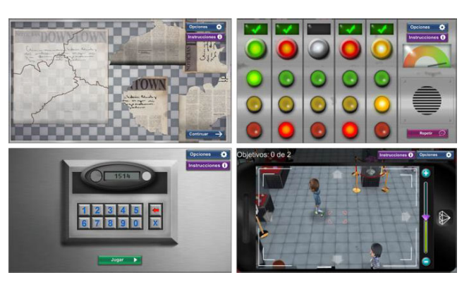
FIGURE 7. Screenshots of the minigames (puzzle, Simon, safe box, camera).

medium level than in hard and expert level. Also, this number remains the same in hard and expert level.