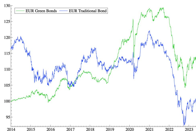
Fig. 1 Green and traditional bonds.

The time series analyzed in this manuscript are represented in Fig. 1.