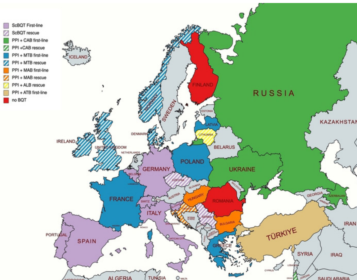
Figure 3 Most frequently used bismuth quadruple therapies by European country. Countries in grey did not participate in the registry. ALB, amoxicillin, levofloxacin, bismuth; ATB, amoxicillin, tetracycline, bismuth; CAB, clarithromycin, amoxicillin, bismuth; MAB, metronidazole, amoxicillin, bismuth; MTB, metronidazole, tetracycline and bismuth; PPI, proton pump inhibitor; ScBQT, single-capsule bismuth quadruple therapy.