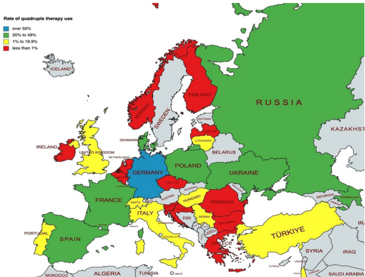
Figure 2 Proportion (%) of bismuth quadruple therapy (over all Helicobacter pylori treatments) by European country. Countries in grey did not participate in the registry.

available after eradication treatment), regardless of adherence. As recommended by the HP-EuReg scientific committee, the mITT analysis was considered to provide the best reflection of effectiveness in clinical practice and is used to report the effectiveness results in this paper.